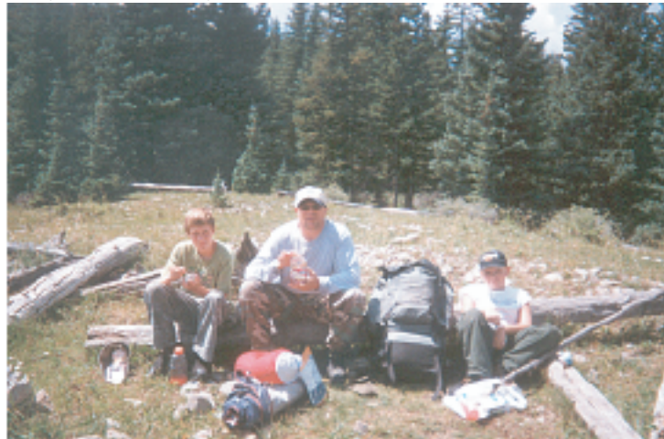
Fallen timber in one of the high mountain meadows on the trail to Lost Lake provides the hikers with a comfortable rest stop and a scenic place to eat. Frequent stops on the first part of the climb helped acclimatize the hikers.

The climb is not a light undertaking. The Wheeler Peak trail starts at around 8,700 feet and rises an additional 4,500 feet on the nine mile trail. Most years, snow is around even in August and September. It gets very cold at night and sometimes storms, hidden by the mountain, come up quickly. You have to be prepared. David said, "Some sort of training is recommended before attempting a hike like this. We started by building up our endurance by walking and climbing, then walking and climbing with a load. You have to pack in food, clothes, sleeping bags, tents and everything you might need for three days of hiking and camping in the wilderness." David, Mark and the boys started their hike on a Saturday morning in August. They hiked by fast flowing streams; through a pine