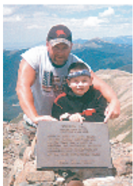
Climbing the highest peak in New Mexico was quite an accomplishment for this ten year old Texan.