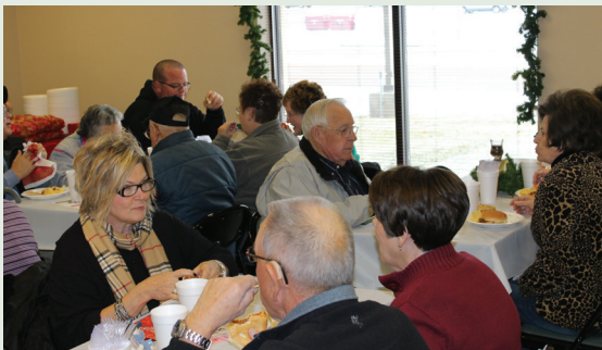
Shown here are some of XIT's Dalhart customers enjoying a BBQ lunch at our 2013 Christmas Open House.