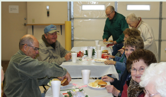
Just a few of the friendly folks in Dalhart who joined us for lunch last year at the XIT Christmas Open House at our downtown office.