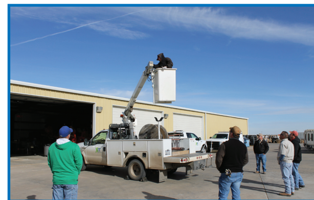
Performing his actual lift and final step in his hands-on training is Pat Gilliam, XIT Sr. Installation & Repair Technician.

Topics covered by the training included: hydraulic and hydraulic/electric systems; the mechanical systems; weight restrictions; high-voltage overhead power line distances and restrictions; proper grounding of tools and equipment; ground fault circuit interrupters (GFCI); site inspections and ground conditions; adverse weather conditions; proper attire and personal protective equipment (PPE); and fall protection. At the end of the training, each participant completed a hands-on truck inspection, lift inspection, and fall protection inspection; and also performed an actual lift in the bucket, demonstrating knowledge of the equipment and controls. As a result of participating in the training, each participant received a (365-4055) Bucket Truck Operator's Certificate and was awarded 0.8 Continuing Education Units from Frank Phillips College.