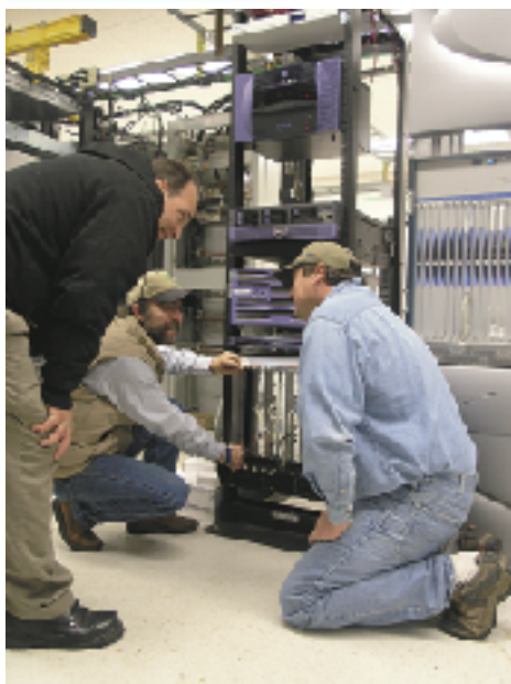
Network and switching technicians work long and tedious hours to cutover new GSM soft switch.

XIT Wireless began offering service in June of 1990 with only three analog towers. With bag phones and car-mounted mobiles, three towers provided coverage for much of the area at that time. To keep up with technol-