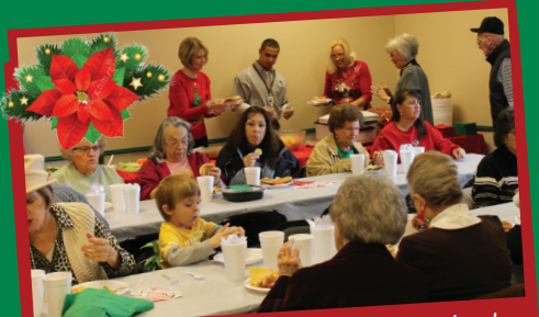
Dalhart area customers enjoyed a BBQ lunch at the downtown office last year.