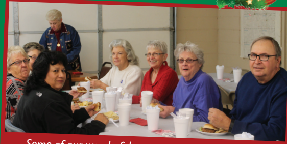
Some of our wonderful customers enjoying lunch last December at our Stratford office.