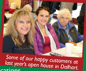
Some of our happy customers at last year's open house in Dalhart.

The holiday season will be here before we know it, and with the season comes the XIT Christmas Open Houses! Mark your calendar to come by and enjoy a wonderful BBQ meal with all the trimmings at one of our three office locations.