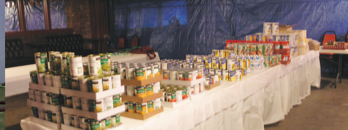
The assembly line is ready...lots of nutritious food to be donated to families in need.