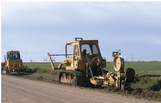
Dale Robertson and his crew are seen plowing in fiber optic cable during XIT's construction project

Existing copper infrastructure will be utilized for deployment of new copper based VDSL2 equipment in the towns of Dalhart and Stratford. New fiber will be constructed to support FTTP in areas immediately surrounding Dalhart and Stratford. The buried plant will consist of fiber optic cables placed at a minimum depth of 42 inches below the surface in most areas primarily along previously disturbed existing Rights-of-Way, established streets, roadways or travel routes. This construction requires a trench, placing the appropriate sized cables, backfilling and compacting to restore the ground to its original condition. An alternate method, used when applicable, is the plowing of the cable with a ripper attachment which opens a narrow slot, inserts the cable and covers in one operation. This is useful in areas where rock contents are minimal and construction paths are free of obstructions. If concrete or paving is required to be cut, it is restored as appropriate. In most cases, a bore will be made under these type obstructions. The cable will then be pulled through the bore leaving only a minimal surface disturbance. Every effort is made to minimize environmental damage during the construction phase. Customers served by Fiber-to-the-Premise will require a new typical fiber service drop consisting of a buried fiber service drop and either a fiber termination box (NID), located on the exterior of the building, or a cable entrance to a designated interior termination room.