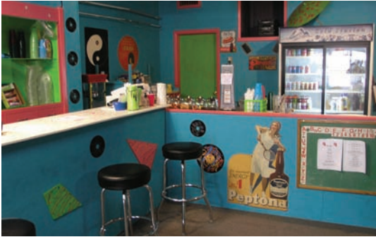
With plenty of barstool seating, you can enjoy your ice cream inside or outside on the picnic tables out front.