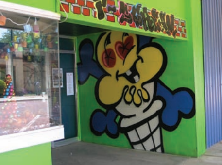
You can’t miss iScream on Denrock Ave, just look for the lime green and giant ice cream cone!