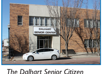
The Dalhart Senior Citizen Center located in downtown Dalhart.

The Dalhart Senior Citizen's Center has been in Dalhart since 1994. The building was the former education building of the First Baptist Church When the church built