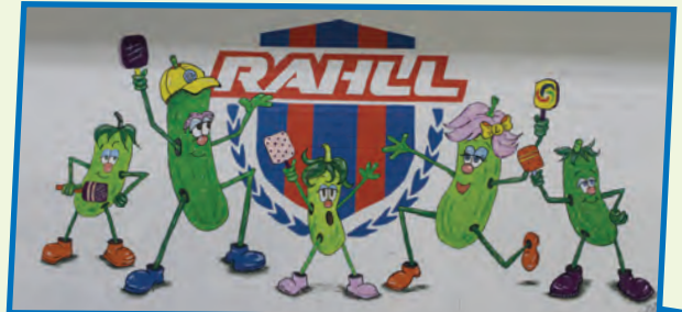
The old boys Locker Room at the Allen Finch Gym has been converted to the Pickleball court, as seen here.