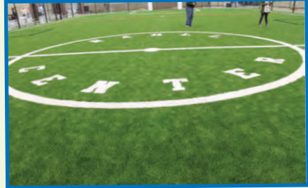
The center of the soccer court was customized for the center.