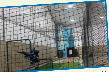
This photo shows the batting cage and rock climbing wall at the Rahll Activity Center.