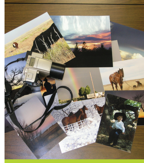
Mail entries to:

Updating your account information is an ongoing process. If you do not currently have a CPNI password established, or there has been a change in your contact information or mailing address, please contact your nearest XIT retail location. Our customer service personnel can assist you with your CPNI password set up and review your account to verify all information is correct. We appreciate your business and thank you for assisting us with our effort to maintain current and accurate information on your account record.