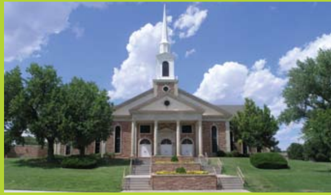
The Chapel at Boys Ranch, Texas is one of the first things you see when you arrive on the Ranch. Sunday services at this non-denominational chapel is an integral part of the experience of living at Boys Ranch.